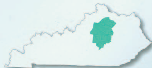
Kentucky's Bluegrass region