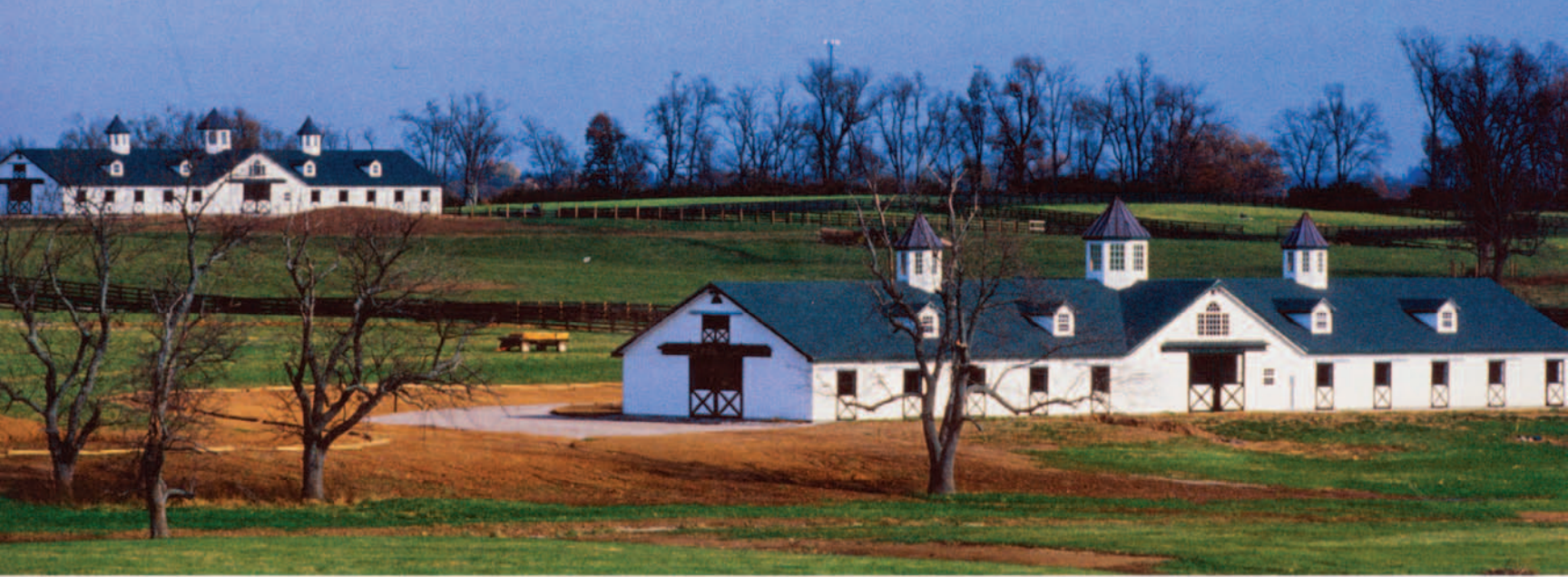
HORSE BARNS ON THE PARIS PIKE