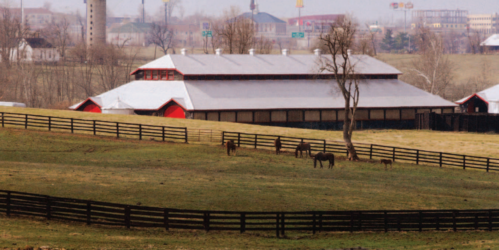
URBAN SPRAWL ABUTS A FAMILY FARM, ABOVE. THE WATERS OF SOUTH ELKHORN CREEK HAVE POWERED THE TWIN TURBINES OF WEISENBERGER MILL, BELOW, SINCE THE EARLY 1800S.